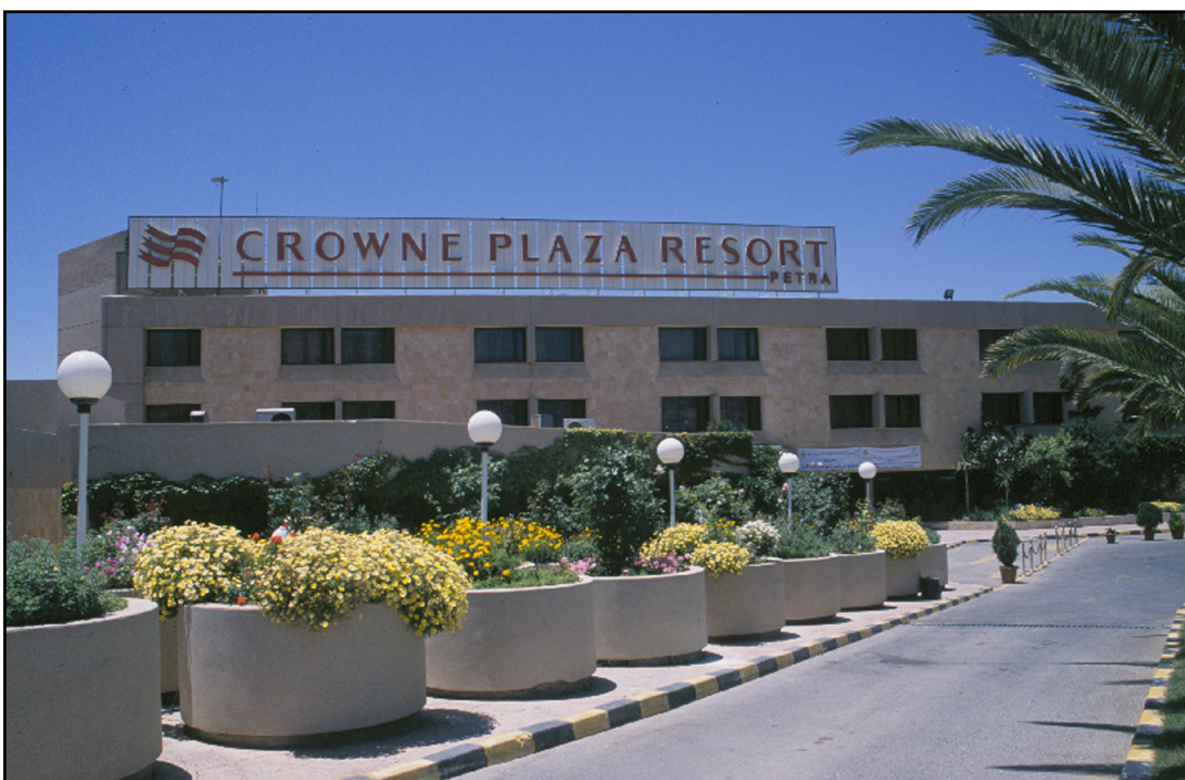
The Crowne Plaza Resort Hotel in Wadi Musa where the Conference was held.