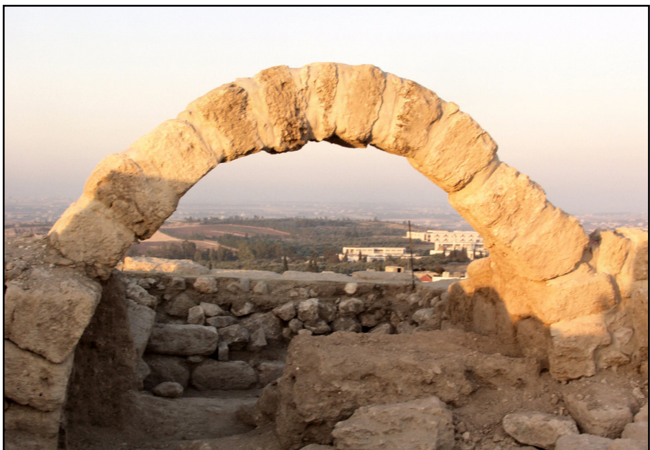
Arched doorway of the Mamluk Governor's Residence at Tall Hisban.

believed to be the residence of the Mamluk governor of the Balqa' in the fourteenth century A.D. Further investigation here in 2004 produced the floor plan of a series of rooms connecting this residence to the fortification wall. Renewed excavation on the western slope of the tell (Area C) explored the Middle Islamic village. A large stone building, 11 m long and originally barrel-vaulted, was discovered and identified as a Byzantine farmhouse. The structure was reused and significantly rebuilt in the Mamluk period (fourteenth century) as a stable and then further refashioned in the nineteenth century for a similar purpose. The team opened up a new field of excavation (Area O), on the southwestern slope of the tell, to further investigate masonry identified at the end of the 2001 season. This turned out to be a heavily constructed, one-room building measuring 9.6 x 6.2 m, covered by a stone barrel vault, and enclosed by large walls (1-1.5 m thick and preserved to a height of eight courses). This apparent farmhouse has been tentatively dated to the early nineteenth century and appears to occupy the original site of the modern village of Hisban. Excavation also continued on the northeastern slope of the tell (Area M), where a Mamluk storage facility, built