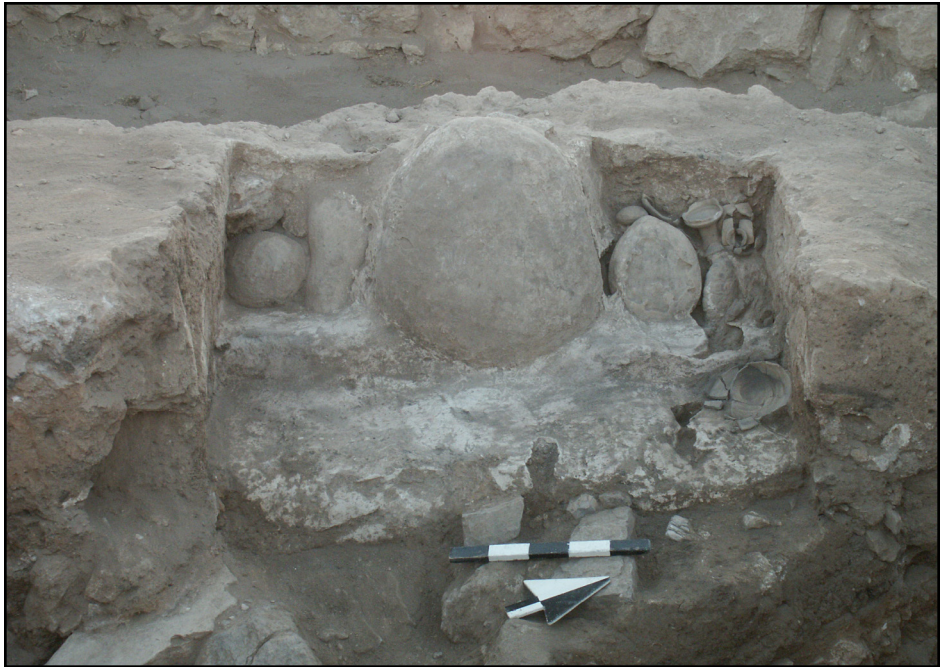
Cultic Niche in mudbrick wall of Late Bronze Age Building at Tall al-‘Umayri.

The tenth season of excavation at Tall al-‘Umayri was conducted between June 23 and Aug. 4, 2004. It was sponsored by La Sierra University in consortium with Canadian University College, the Division of Architecture at Andrews University, Mount Royal College, Pacific Union College, and Walla Walla College. Excavation took place in four fields. Earlier seasons have produced finds from the Early Bronze Age through Persian periods with limited remains from the Hellenistic through Byzantine periods.