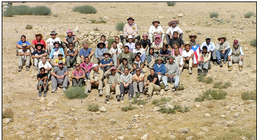
Jalul 2007 Team.