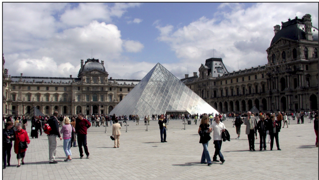
The Louvre, Paris, France.