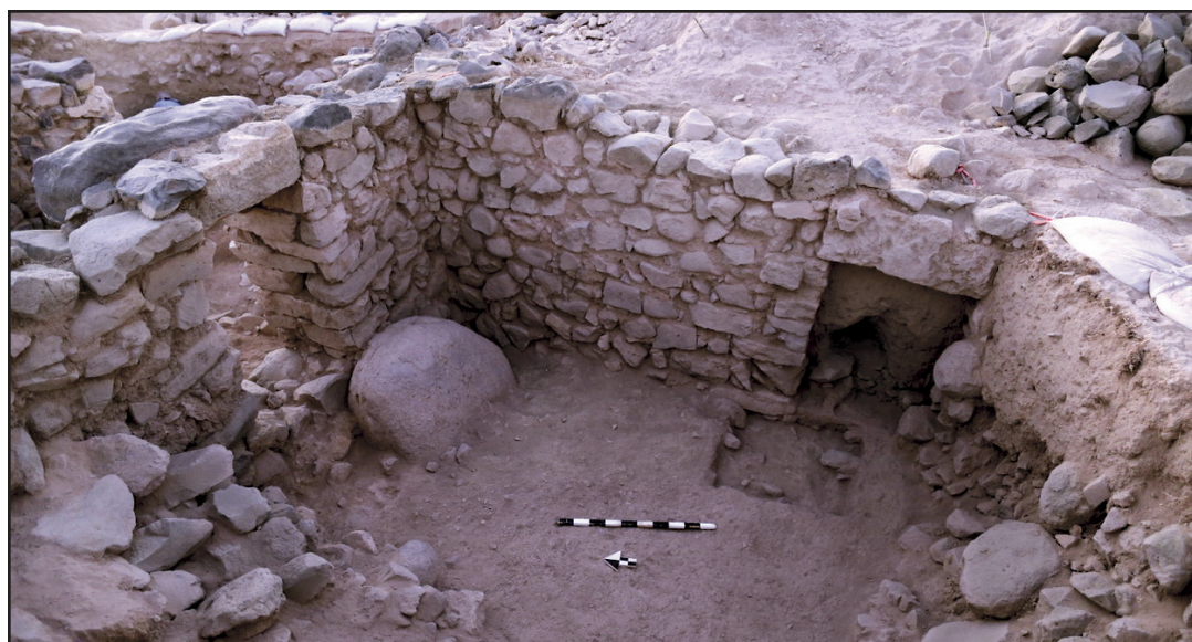
Area H House at Balu'a.